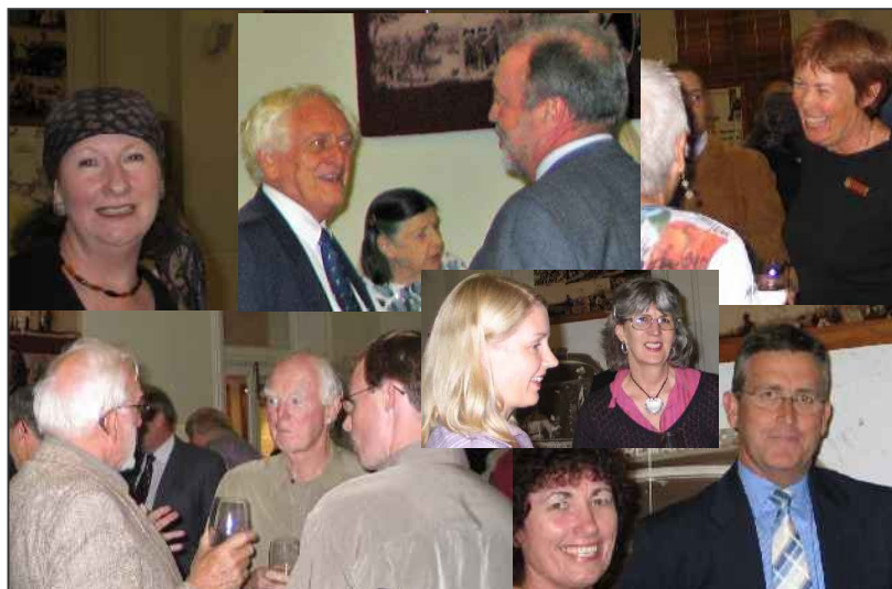
Above: Members and guests at the March History Council Forum on the Teaching of History in Secondary Schools.

Our thanks to all participants for a useful and thought-provoking session.