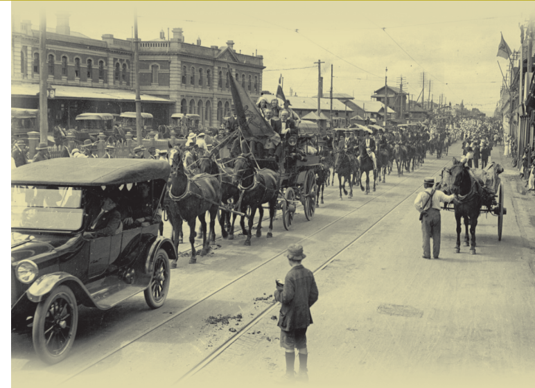
St Patricks Day parade, Wellington Street